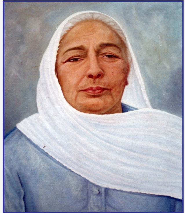
Mata Ram Kaur Ji