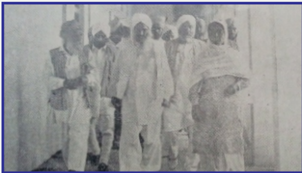
Chief Minister of Punjab S. Partap Singh Kairon in our Campus (1962)