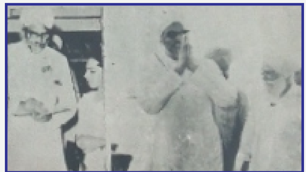
S. Swaran Singh Minister of Foreign Affairs and Ex. Defence Minister of India in Our Institution (1967)