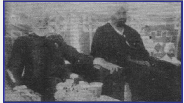
S. Ujjal Singh, Governor of Punjab visits Our College (1962)